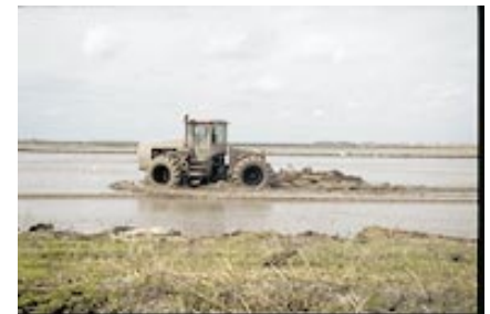
Leveling rice fields in preparation for planting can result in periodic discharges of high-turbidity and high-nutrient water into surrounding waterways. The Acadian-Pontchartrain Study Unit contains over 400,000 acres of rice fields.