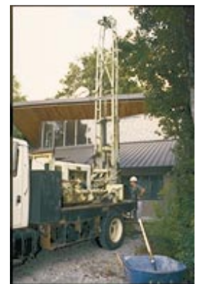
Well drilling at Bluebonnet Swamp Nature Center in Baton Rouge. The well will be used both for age-dating shallow ground water and as an interpretive exhibit for visitors.