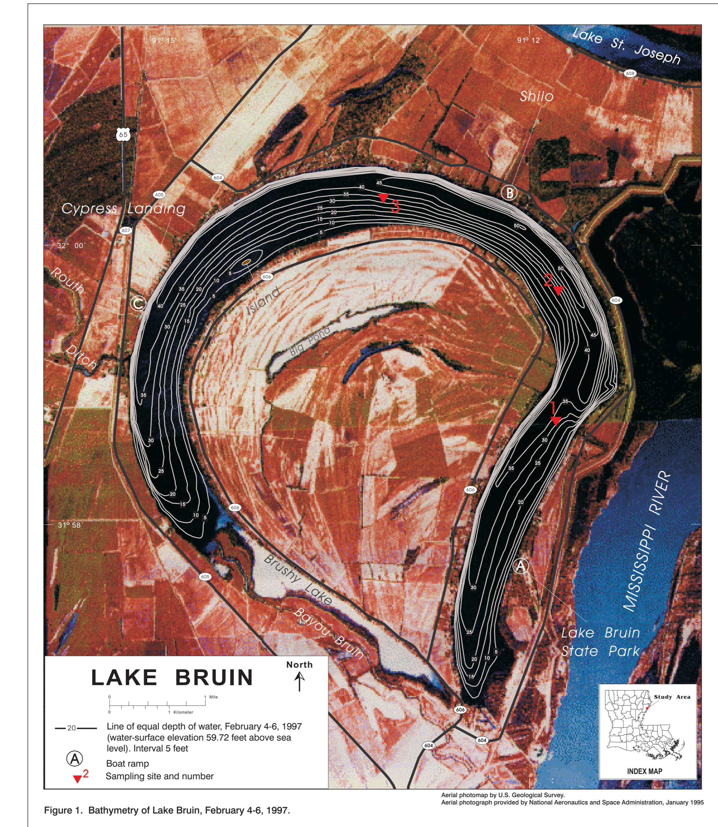
Figure 1. Bathymetry of Lake Bruin, February 4-6, 1997.

Surface area and volume spatial analyses also were performed within ARC/INFO. The water-surface area of Lake Bruin